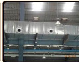
Fresh Air duct