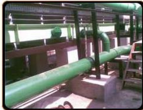
Condenser Water Piping