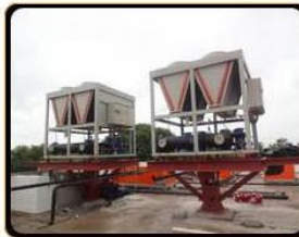
Chilled Water Piping