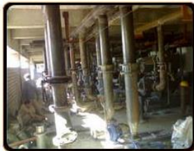
Chilled Water Piping