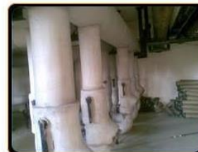
Sand Cement Plaster